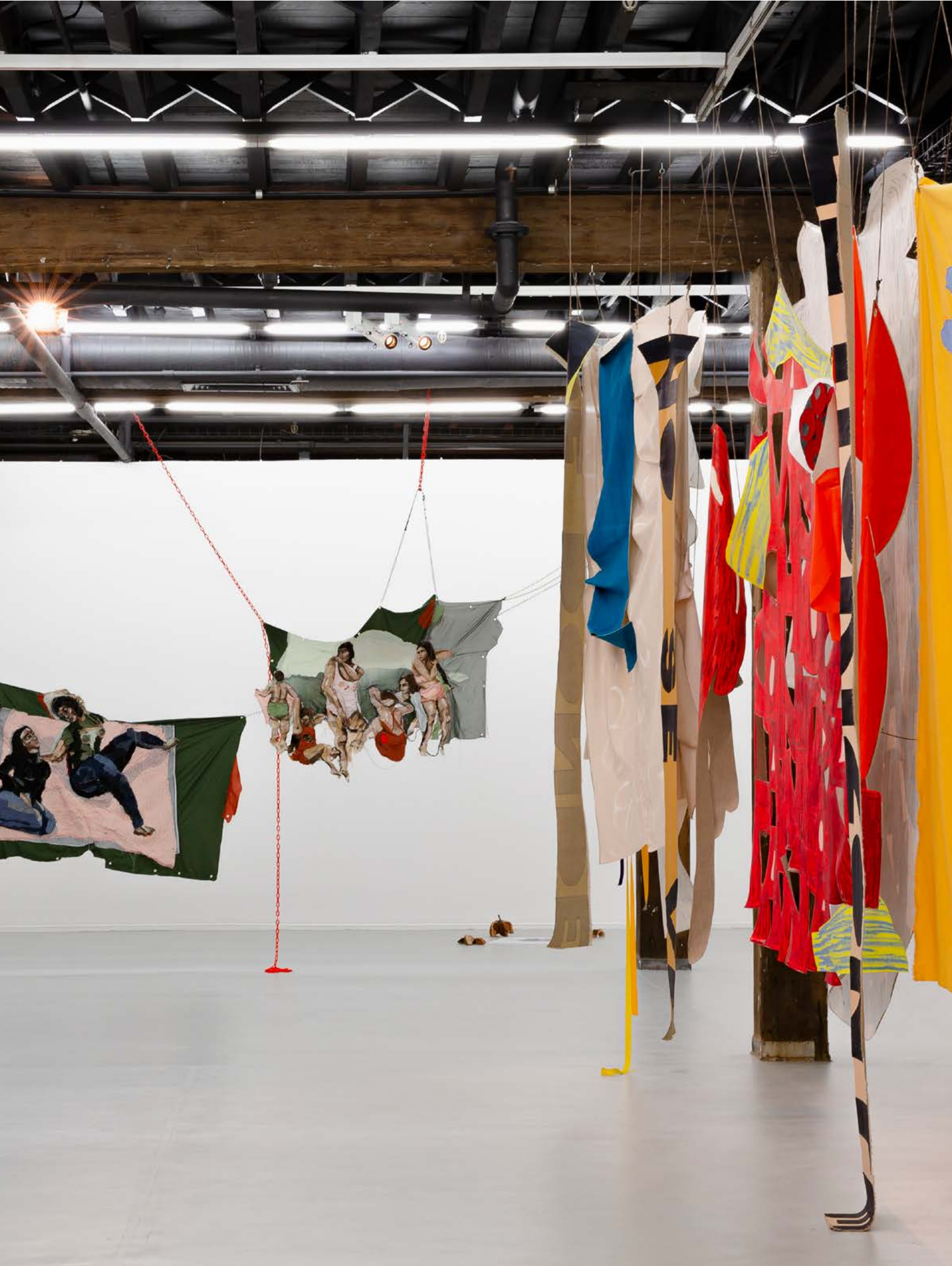
2020 NSW Visual Arts Emerging Fellowship, installation view, Artspace, Sydney.