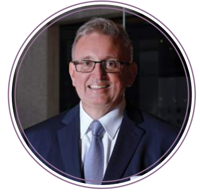
The Hon. John Barilaro Deputy Premier Minister for Regional NSW Minister for Skills Minister for Small Business

I look forward to hearing about and seeing the local success stories that I know we can achieve together.