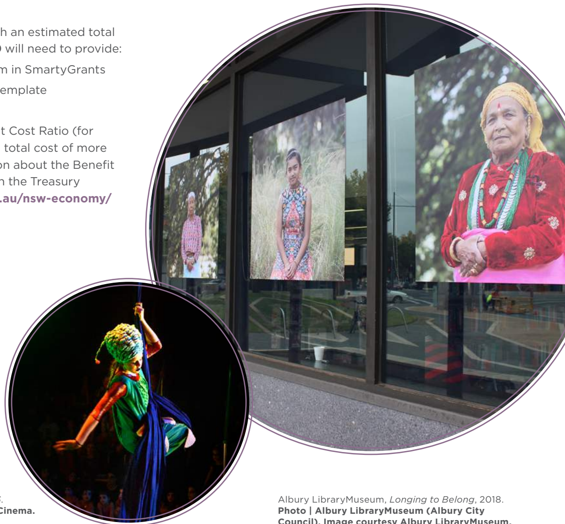
Spaghetti Circus - Momeraths , 2016.

Applicants should note that co-contribution is mandatory and higher levels of co-contribution will be viewed favourably in the assessment process.