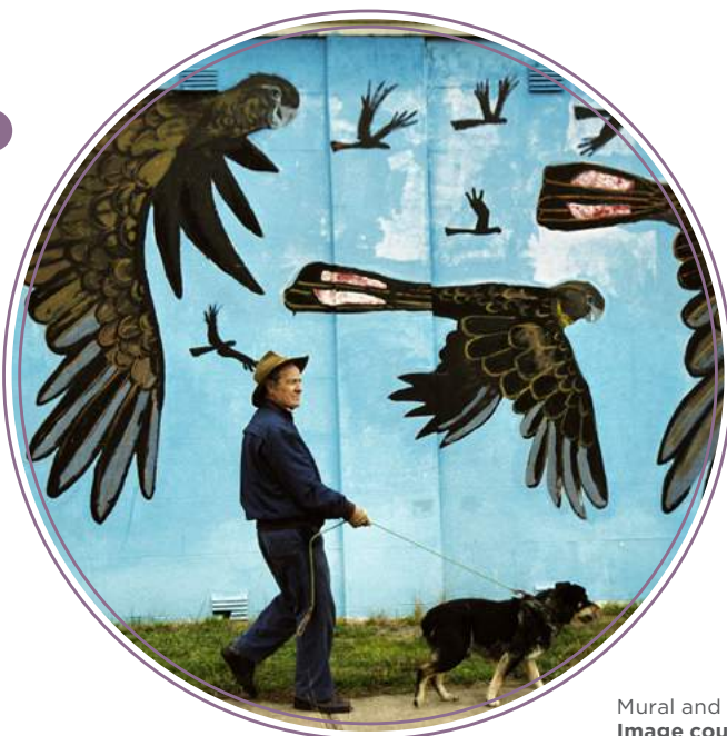
Mural and dog walker, Mendooran.