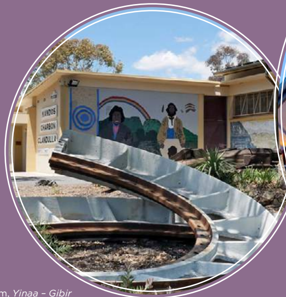
Kandos Museum, Yinaa - Gibir (A Woman - A Man) mural by Djon Mundine and Wiradjuri Dabee clan, 2015.