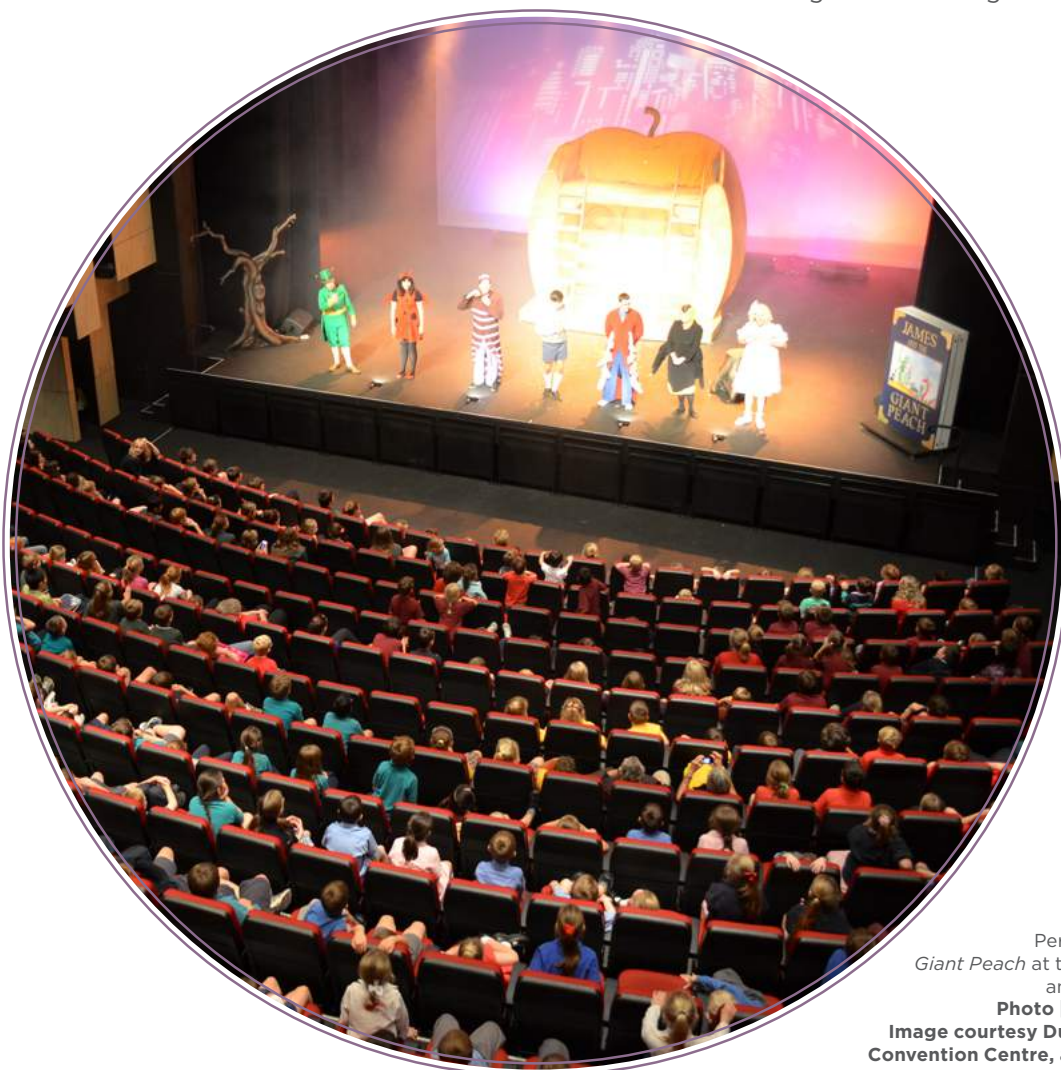
Performance of James and the Giant Peach at the Dubbo Regional Theatre and Convention Centre, 2012.