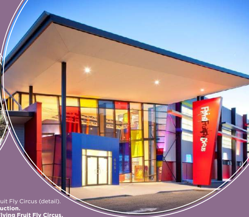
Exterior of Flying Fruit Fly Circus (detail).