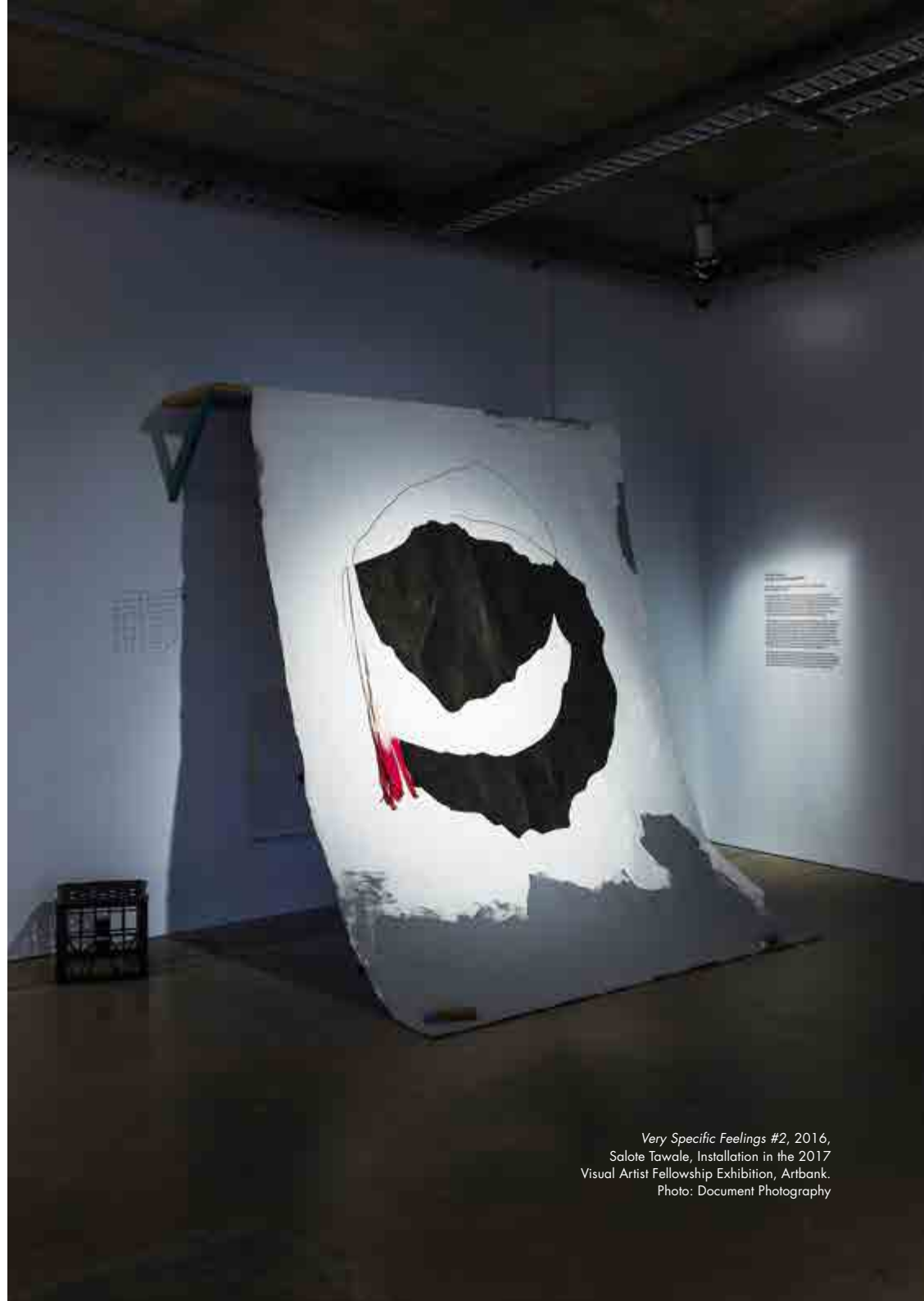
Very Specific Feelings #2 , 2016, Salote Tawale, Installation in the 2017 Visual Artist Fellowship Exhibition, Artbank.