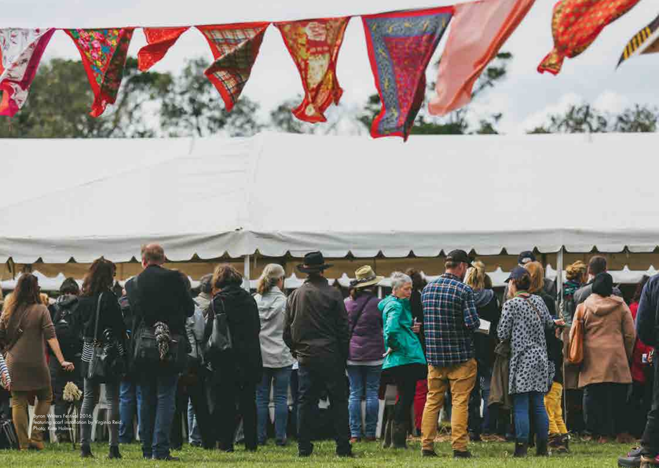
Byron Writers Festival 2016, featuring scarf installation by Virginia Reid.