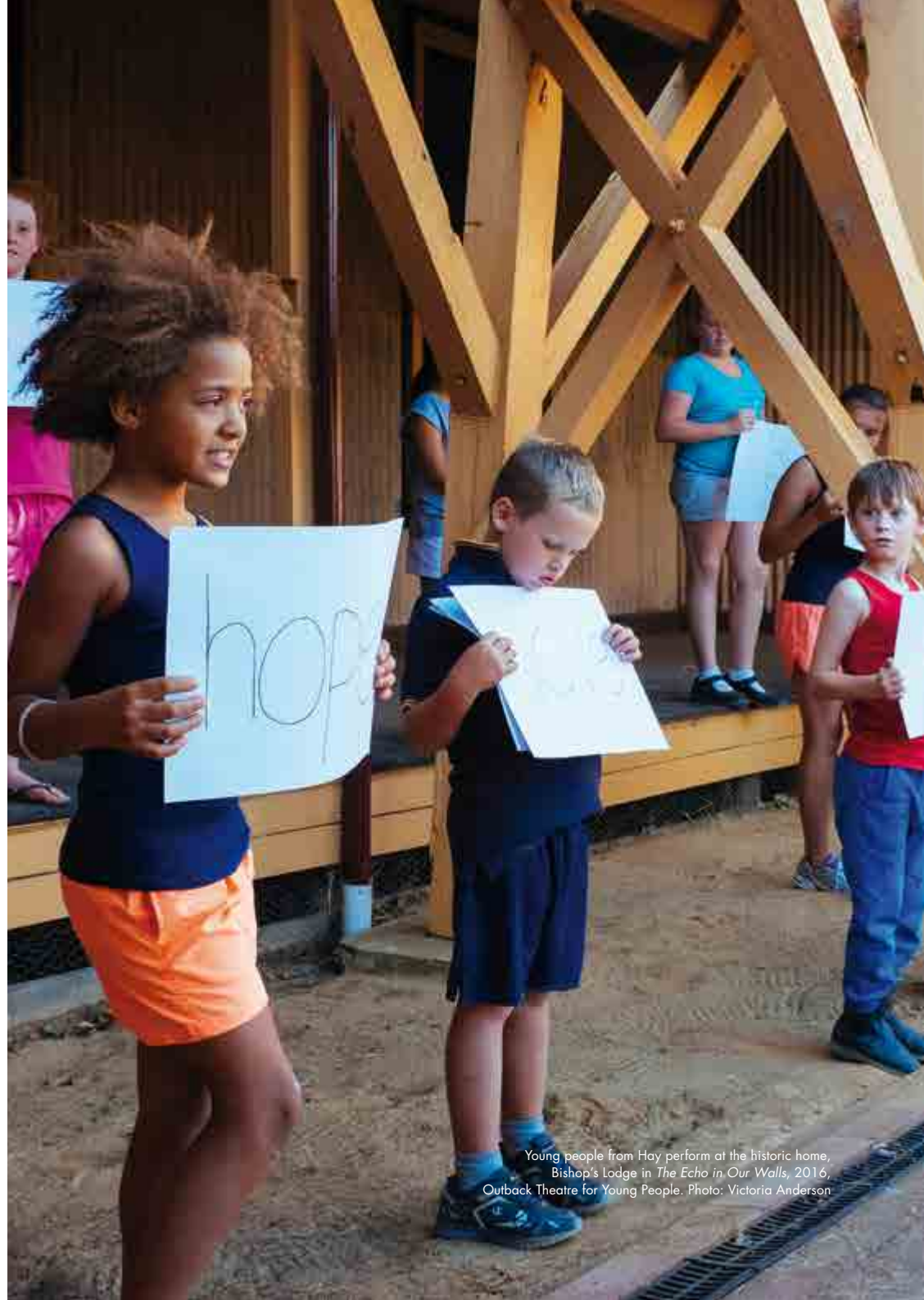
Young people from Hay perform at the historic home, Bishop's Lodge in The Echo in Our Walls, 2016, Outback Theatre for Young People.

All applications engaging with the Aboriginal arts and cultural sector, and/or involving Aboriginal people, organisations and cultural material, must demonstrate that they adhere to the Aboriginal Arts and Cultural Protocols 2011 .