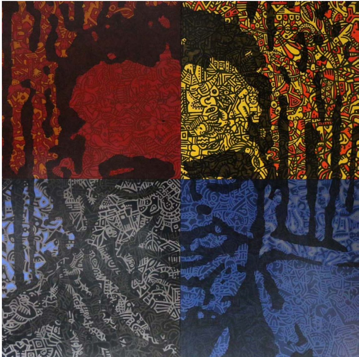
Warwick Keen, "SELFIE" – NSW, 2015.