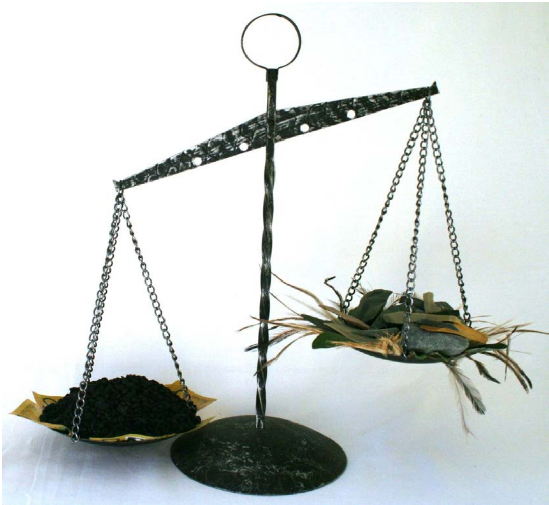
Aleshia Lonsdale, Significant to whom for what? 2015.